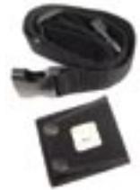
Belt & Clip for Holster