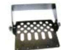
Top Mount Swing Arm Bracket & Computer Back Plate