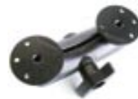
Rotational Ram Ball Assembly