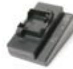
Single Slot Battery Charger