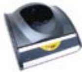
Single Slot Dock (mono)