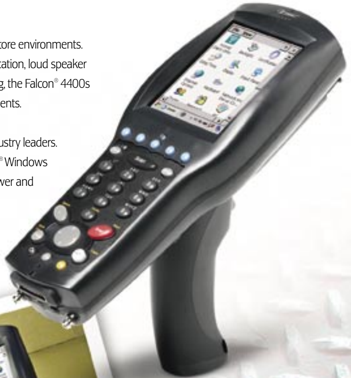
The Falcon® 4400 series are at home in both warehouse and in-store data collection activities.

Falcon® 4400 models with an integrated handle are ergonomically designed for scan-intensive applications. Handless models are contoured to fit comfortably in an operators hand for extended periods of fatigue-free data collection activities. The Falcon Management Utility and Falcon Desktop Utility are included with every unit providing remote management and configuration.