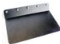
Keyboard Tray Bracket