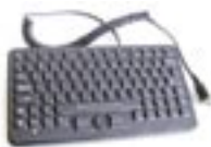
NEMA 4 Standard Keyboard