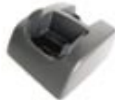
Single Slot Dock