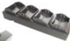
4 Slot Lilon Battery Charger