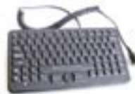
NEMA 4 5250 Keyboard