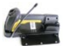
Scanner Tray Bracket