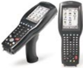
FALCON 4410/20 SERIES