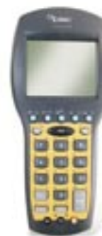
The Falcon® 335 is available with either a standard 38-key full alphanumeric or 25-key large numeric keypad