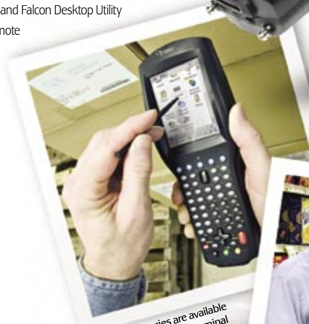
Falcon® 4400 series are available with optional IBM 5250 terminal emulation keypad