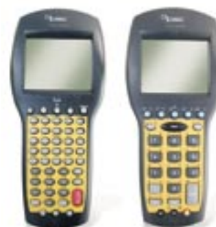
Keypad configurations available with the Falcon® 345