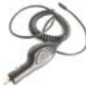
Car Charging Adaptor