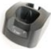
Single Slot Dock & Battery Charger (color)