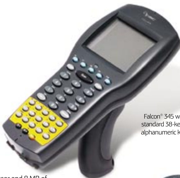
Falcon® 345 with standard 38-key alphanumeric keypad

Additional flexibility comes with the wireless connection of Falcon 345 terminals into an existing legacy system. The Falcon® 345 comes with a choice of 25, 38, and 48-key keypads. A batch model, the Falcon® 340 is also available.